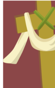
Easter Vigil 9:00 p.m.