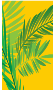
Palm Sunday 9:00 a.m.