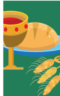
Maundy Thursday 6:30 p.m.