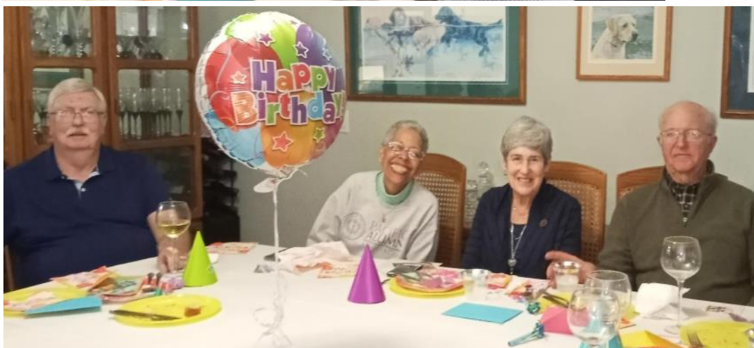
Two Grace Gatherings groups met for an evening of fun and fellowship. A delicious dinner and birthday cake was on the menu to celebrate everyone's birthday in the group.